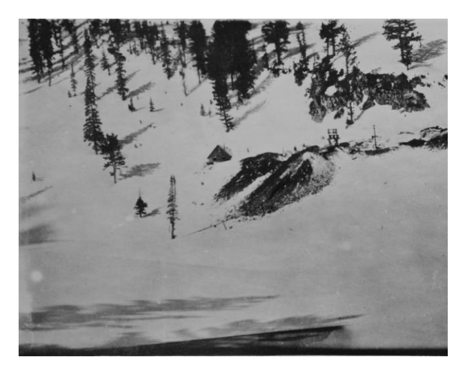
After the Avalanche