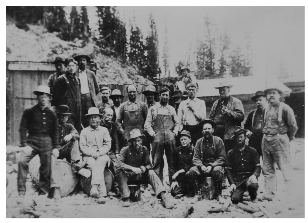
Lake Solitude Avalanche of 1911