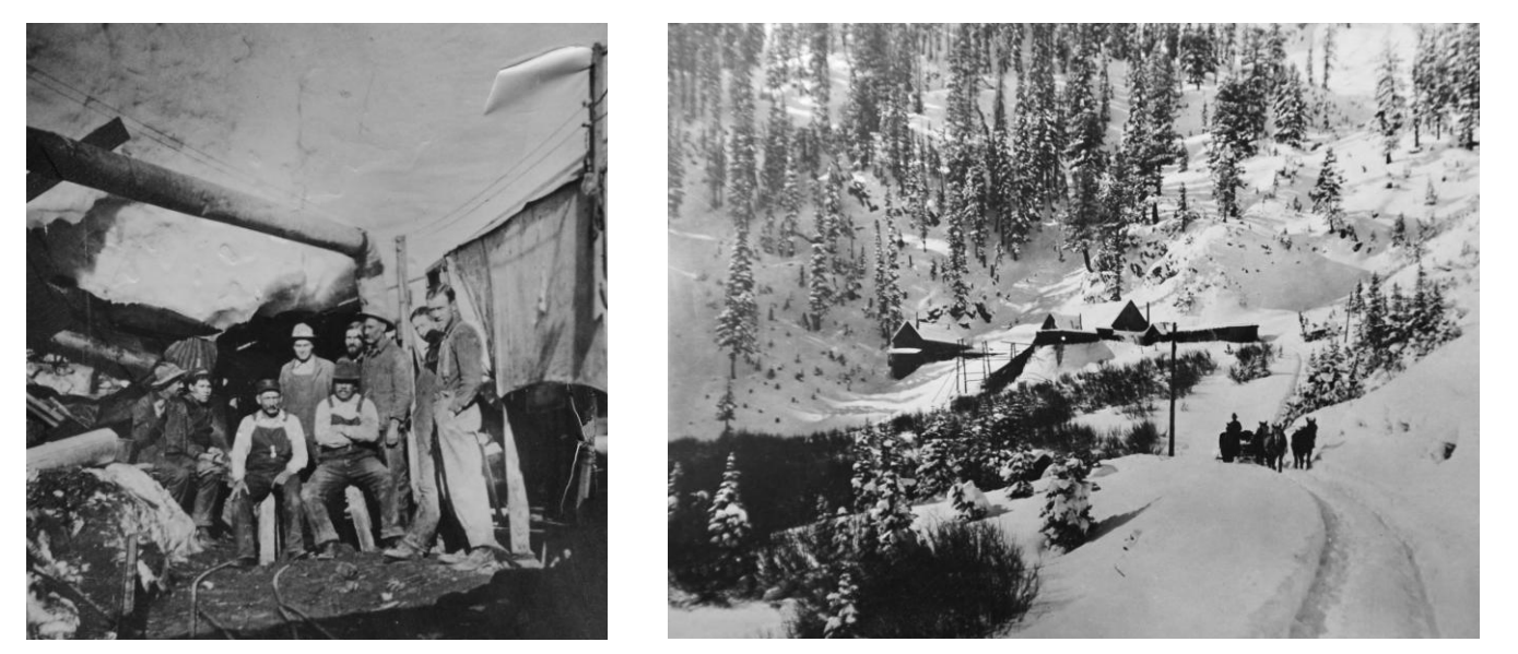
Tranquil winter scene at the prosperous mine.

The Solitude Tunnel was the UMC's lowest portal to the Michigan Utah group of mines. Most ore was taken out on the Alta side. The mine closed in 1928, but remnants of the Solitude Tunnel are visible today on the south side of Lake Solitude.