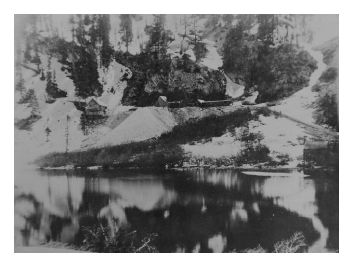
Before the Avalanche

Suddenly about 5 a.m. all the snow on the side of the mountain broke loose and came down full force, taking all the mine buildings down to the bottom of the canyon. It smashed the bunkhouse where seventeen men were sleeping. Seven managed to crawl out. Barefooted and dressed only in underwear, they scrambled into the wreckage for shoes and clothing, then set to work digging out seven the other men. Only three were smothered in the snow. The miners who moved into the mine were safe, but had to be dug out because snow was packed into the tunnel. --- From the memoirs of Asa Bowthorpe Pioneer Sawmills and Canyons of Salt Lake Valley